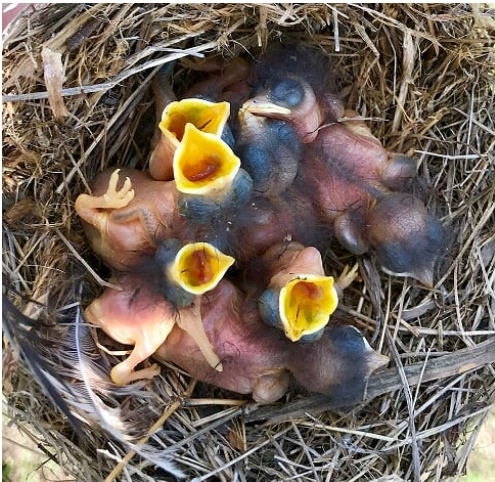
Eight bluebird nestlings; three are behind the others in size.

one unhatched egg. Three babies looked a day or so behind the other five in size and one looked extremely weak. I waited six more days to check and found seven babies doing well, but two definitely looked a day or so younger than the other five on May 4. The parents had removed the unhatched egg and one baby was gone, most likely the tiny weak one that did not survive.