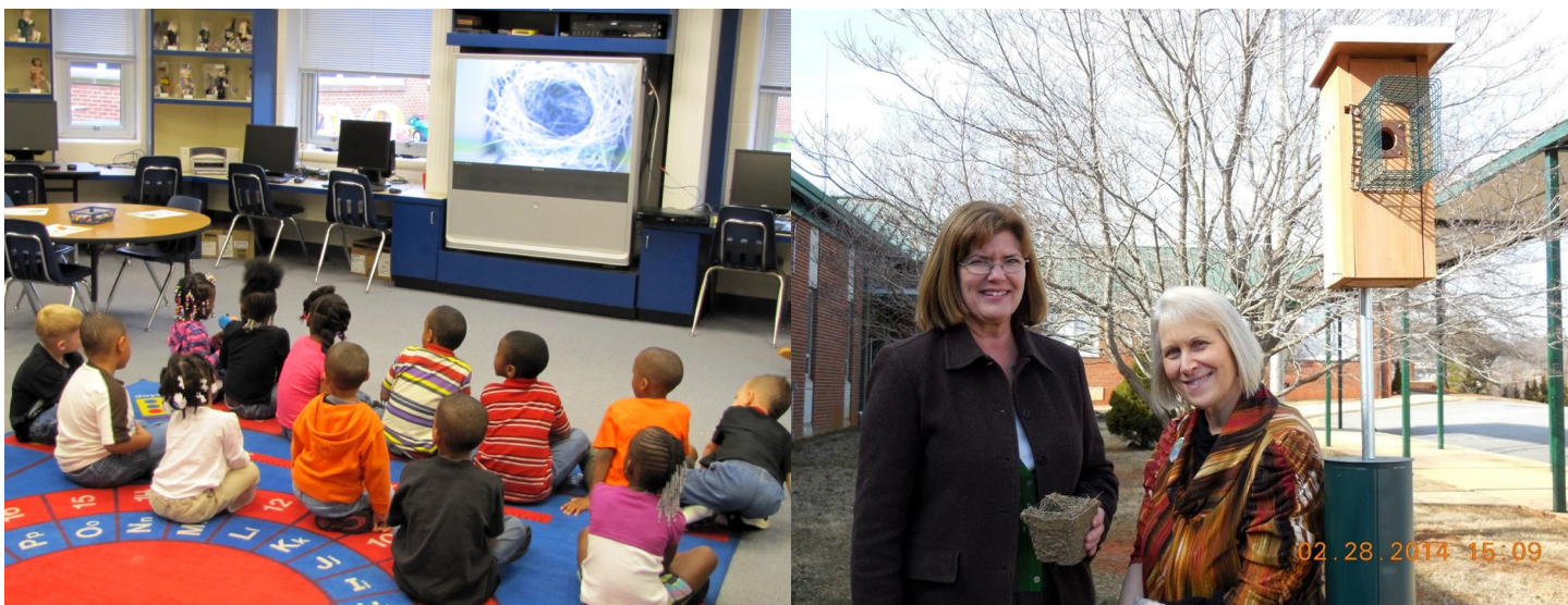
Left: Students in the library at Grove Park Elementary in Danville, watching the nest cam

This is where our passion to get nest cams in Virginia Schools comes into play. We must ignite the passion in the next generation, and how better to do this than to be able to show them right in their classroom! I encourage those who may be reading this to send teachers to our web site to see our many grant programs. We have grants to refurbish old trails and to build new ones; this is what funded the cemetery trails in Danville. We have grants to help scouts and other groups build bluebird boxes. I have mentored three boys who received their Eagle Scout level through this grant, and we used these houses to begin bluebird trails at Danville public schools. Lastly we have the nest cam program, which is a grant to provide the nest box, predator guards, and cameras to schools that apply. All of these resources may be found at http://www.virginiabluebirds.org/about-vbs/grant-programs .