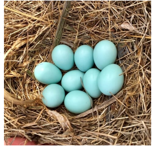
Nine bluebird eggs in one nest, laid by two females sharing a nest. Green Hill Cemetery Trail in Danville, Virginia.

Returning on April 25, there was one baby and eight eggs, so I returned three days later to find eight babies and