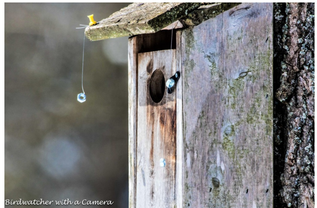
Birdwatcher with a Camera

Paul Davies is spotlighted in the June 2019 issue of Blue Ridge Life Magazine , No. 171, page 27, "The Rocket Science of Bluebird Boxes." Paul is building bluebird boxes out of each type of wood from native trees in Virginia and displaying them at the Quarry Gardens in Schuyler, Virginia. You can read the story at https://issuu.com/blueridgelife/docs/brl_32pg_june2019_052919_issuu .