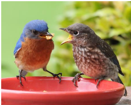
Bluebird parents feeding babies

sunflower as well as the mealworms. I buy hot-pepper no melt suet by the case all summer long and go through much more of it in the summer than winter, as all the birds are feeding their babies from Vickie's baby food buffet. (The advantage of the hot pepper suet is birds love it, and I am not bothered by squirrels or raccoons.)