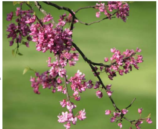
One of many redbuds seen while monitoring the bluebird boxes at Brambleton Regional Golf Course, Loudoun County. These beautiful trees only enhance the enjoyment of counting all of those April bluebird eggs!