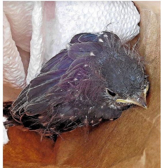
Orphaned baby bluebird