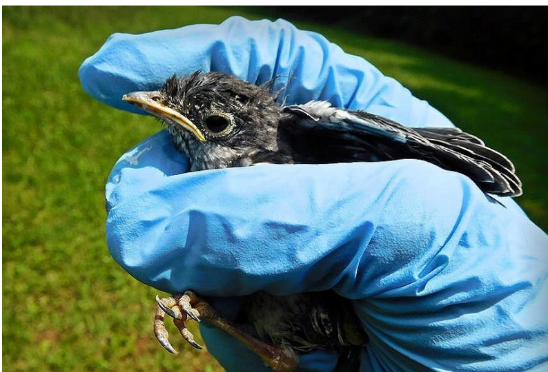
Moving the surviving orphan to another nest box