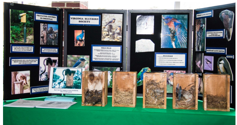
Top right: Many organizations provided information in displays, including our own VBS.