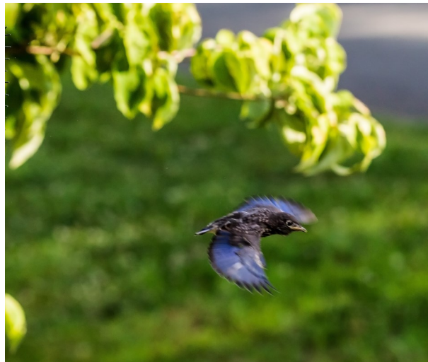
Bluebird fledgling

Whatever the reason, when I look at my numbers, I have to conclude that it is working!