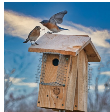
Eastern Bluebird couple on paired nest boxes