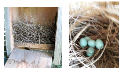
Above left: Ants in the nestbox. Above right: Five rescued bluebird eggs.