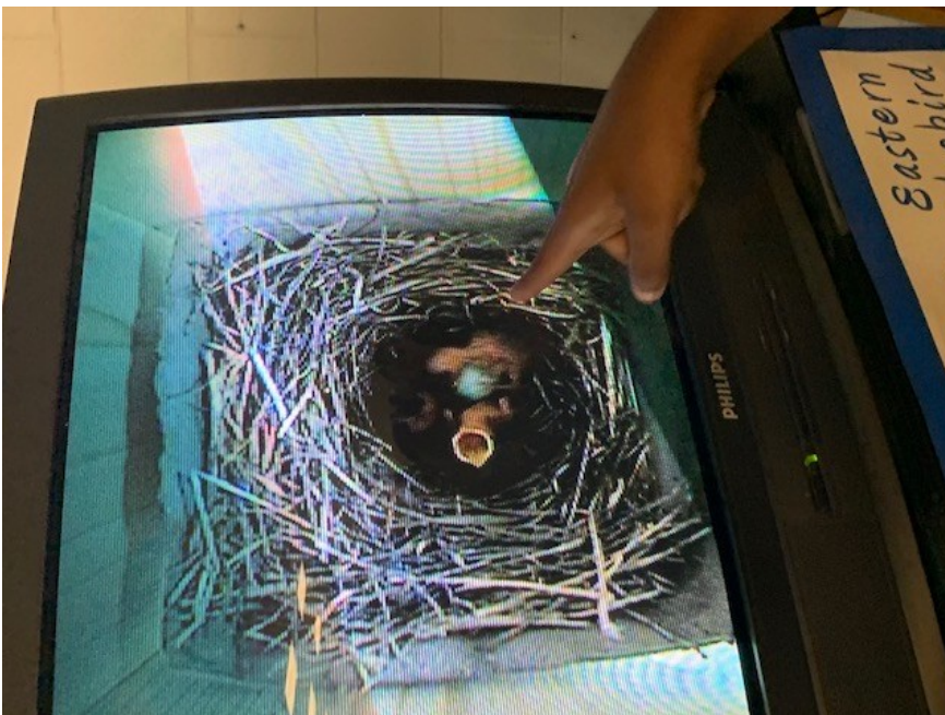
Live feed inside Blackstone Primary