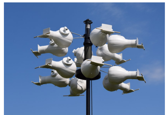
Plastic horizontal gourds such as these are used at all the sites. The martins seem to prefer them and they help guard against predators such as hawks and owls.

For anyone not familiar with the Purple Martin, it is the only North American bird totally dependent on human-created housing for shelter and nesting. It is unknown how many hundreds of years ago this dependency started but it was first noted by colonists coming from Europe that Native Americans, including the Chickasaw and Choctaw Indians, strung cleaned out gourds around their villages to attract the Martins. The birds were useful in chasing away Crows and other scavenging birds which prevented them from damaging the hides the Indians had put out to dry.