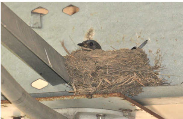
Eastern Bluebirds At robin nest