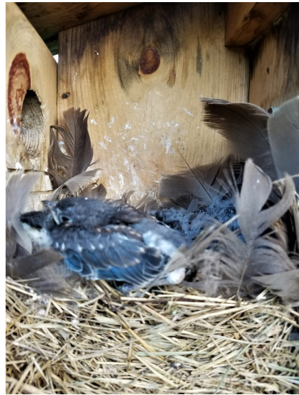
Here are the chicks on 6/27/17, feathers opening, with the bluebird in front. He was moved the next day.

was then checked almost daily to assure all chicks were thriving. By July 5th, all the chicks had fledged. So, we can assume that “Little Blue,” the fostered chick, was accepted and tended by the parent Eastern Bluebirds with the others. On the next regular monitoring date (July 7) the swallow chicks in box #79 had also fledged.