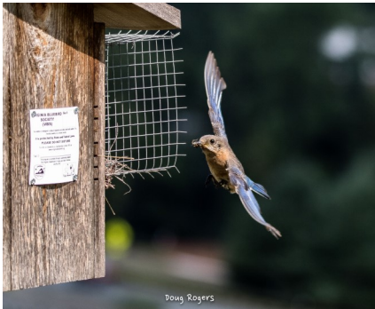
Bottom: Noel guards pronged out