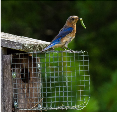
Top: Noel guard with prongs in; snakes can make their way over the edges