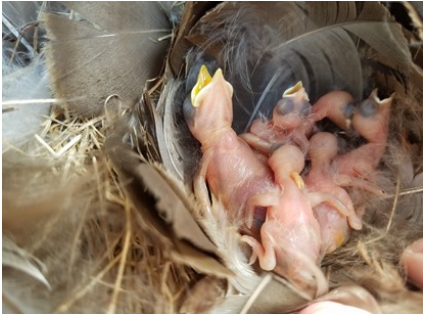
Larger Eastern Bluebird with smaller Tree Swallows

But, two weeks later when the monitor reported four Tree Swallow hatchling and one Eastern Bluebird hatchling (2 unhatched swallow eggs), and sent a photo, we got very excited. I checked the nest box the very next day and confirmed this report (plus another swallow had hatched by that time) and took several photos clearly showing the larger bluebird hatchling with the smaller Tree Swallow hatchlings.