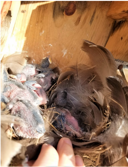
Mixed species nestlings on 6/23/17. The bluebird is on the right.