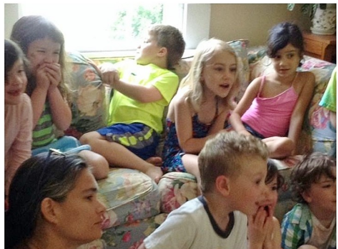
.....and then a chickadee chick came out of the shell.

Not all the eggs hatched and not all the chicks survived, but that is the way of nature. Over the next couple of weeks, we watched the chickadee parents care for the chicks. The chicks opened their beaks so wide each time the parents came to feed them, and they grew. They grew feathers and started to look like the adult chickadees with their black and white feathers. They became so big, they could barely fit in the nest! On the last day of school, we said "goodbye" to our kindergarten friends who were moving on to new schools and to those going away for the summer. The next day the chickadee chicks flew away too, leaving the teachers with empty classrooms waiting to be filled with children and a nesting box ready and awaiting new chicks in the spring.