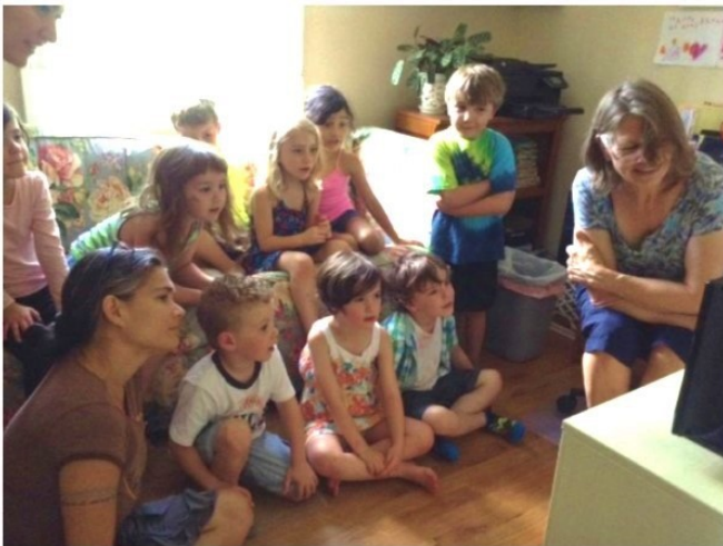
An egg started to crack.....

We prepared ourselves as well! We learned all about bluebirds; what they like to eat, how they build their nests, what their eggs and chicks look like and how they are in need our help. We read books that taught us that the bluebird are in trouble. The land that used to be fields and meadows where the bluebirds like to hunt for insects were being turned into buildings and houses. Also, people use chemicals to kill the insects that the bluebirds love to eat! To make matters worse, there is a nonnative bird who likes to steal their nests and hurt their chicks. Luckily, there are things that we can do to help, like putting up our bluebird box! But bluebirds weren't the only birds who might come visit us! Other cavity nesters like chickadees, wrens, the tufted titmouse and tree swallows may want to raise their chicks in our bluebird box. We learned about them from our books too. There were many giggles when we found out that the tufted titmouse could stealthily steal fur for it's nest from sleeping dogs! But in April, they came. Not the bluebirds we had been hoping for, but a chickadee pair. We watched on the monitor as they built their nest from soft moss and grass. And then we saw the eggs, one at a time, each day until there were six! It was hard to imagine they were so tiny, because they looked so big on the monitor. It was hard waiting for the eggs to hatch. Each day we checked on them, and checked on them, until one afternoon we had a big surprise!