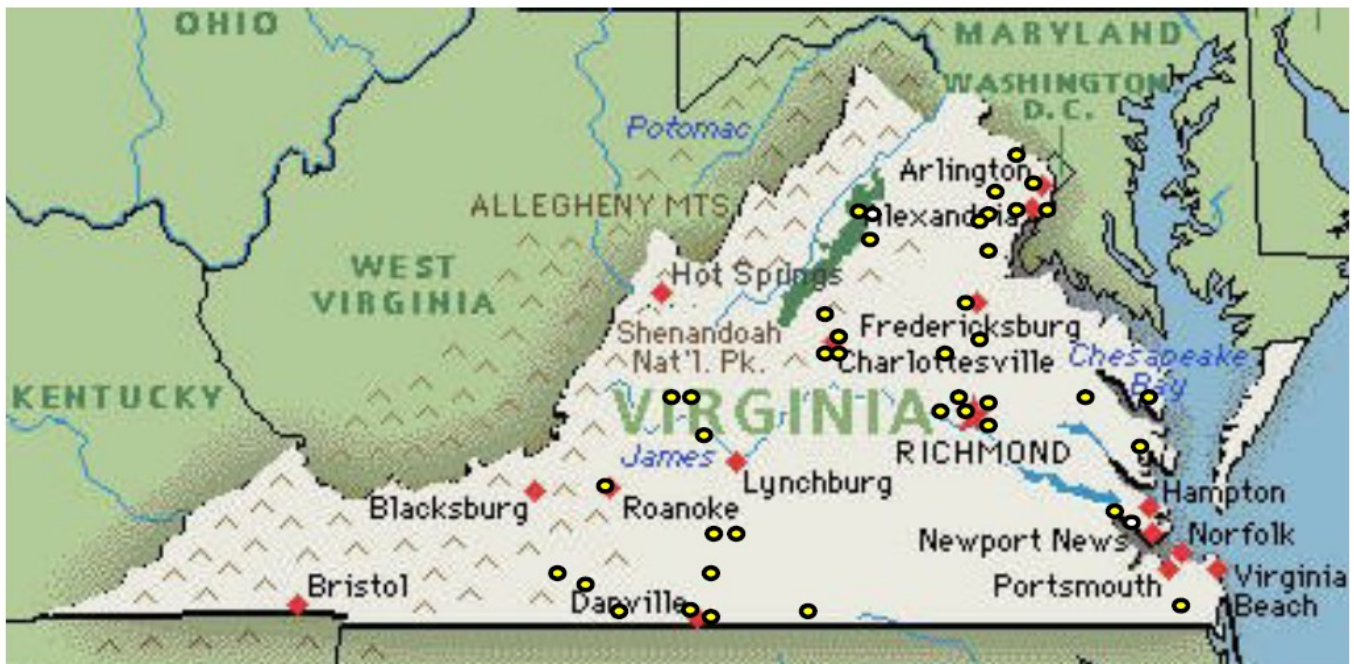
● Denotes bluebird nest cam box

This map of Virginia shows the locations of all 42 nest cams. The areas with many camera boxes usually had a county coordinator involved to spread the word. If you do not see a nest box near your location contact VBS to see how you can apply for a grant for your area schools.