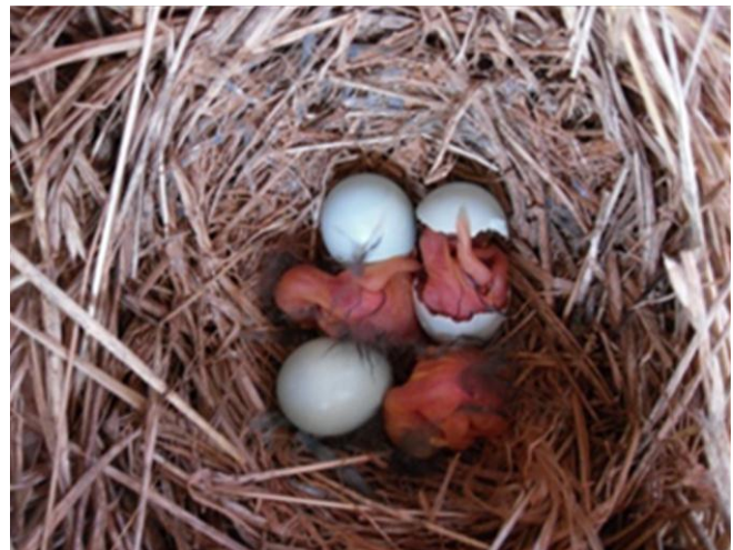
Bluebirds hatching June 22, 2011 (all five hatched and fledged)

at us as we opened the box. When we peeked into the box we realized that her babies were hatching. As one baby wiggled out of its egg, I was awestruck and ecstatic to have the privilege of witnessing this