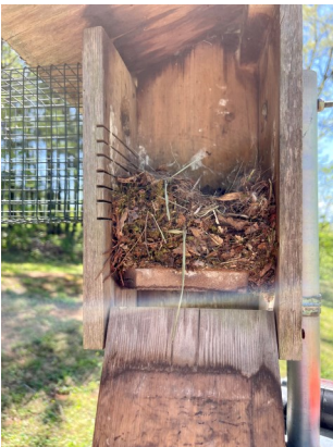
Tufted Titmouse nest crossview.

For the first time on the Woolwine House Bluebird Trail, Patrick County, in the trail's 17 years, I found my first Tufted Titmouse Nest. Six eggs were laid. I was excited. However, the titmouse is very sensitive to human activity and monitoring. This nest box location has had bluebirds year after year, with successful fledgings; we know this species is tolerant of humans. What I found later after the titmouse eggs were laid is the nest was, sadly, abandoned. I was not able to investigate why. Was it due to a bluebird nest started over the titmouse nest or was it possible a House Wren, which I heard singing in the vicinity of this nest box on that monitoring day, removed the titmouse eggs, and the bluebird started building a nest, or could it be this nest was too close to very active human presence, causing the titmouse female to abandon the nest? Carolina Wrens can abandon a nest of eggs, as I learned in past years under the lid of my propane tanks near my breezeway door. Later a House Wren built an active nest with an egg cup over the bluebird nest, which did have eggs. All species being native and nest box competition in between each monitoring check made it impossible for me to get more information. It was my hope for the titmouse to have a full nesting cycle in Nest Box 23, but it was not to be.