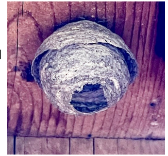
Hornet nest on bluebird box ceiling.

In April, I found the beginning of a bald-faced hornet's nest ( Dolichovespula maculata ), an aerial yellowjacket, in my Nest Box #32 on the Woolwine House Bluebird Trail in Patrick County. Later that day, I decided to start studying this hornet species in detail, and realized it was the queen hornet creating the wood-pulp cylinder nest and cells to prepare to lay her eggs and tend to the cells to feed the hornet larvae. No hornet's eggs were laid yet by the Queen; therefore, no worker hornets were hatched. Once the workers are hatched, a hornet's nest becomes obviously dangerous for nest box managers to handle the situation. I decided to go back that night to scrape out the small nest on the ceiling with my paint scraper, my own safety in mind. When I returned at 9 PM to do this, I found a deceased bluebird in the nest box. It was dark, and even with my flashlight, I could not determine if the bluebird was male or female, but I did see a few added nesting materials added by the female bluebird after my daytime monitoring check took place earlier. I went back in the morning to investigate this situation. What I found was a deceased female bluebird, and next to her