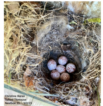
Christine Boran Tufted Titmouse Nestbox 23 - 5/2/23