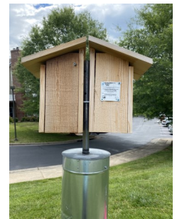
Paired nest boxes for bluebirds and swallows.

In another box that was being haunted by a HOSP, I set the Van Ert trap and trapped a female HOSP. I know that HOSP are invasive; I know that HOSP kill bluebirds; I know that HOSP are considered "rats with wings" but in spite of all that, it still hurts my heart to kill a small bird whose only crime is being hatched as a HOSP. But I did it anyway.