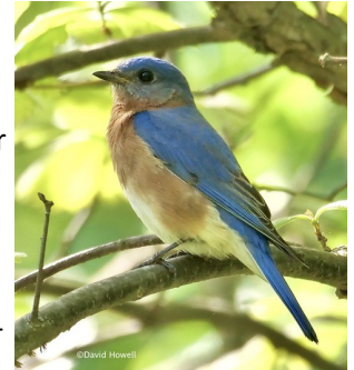
Male Eastern Bluebird at Barcroft Park.