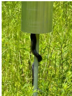
Eastern Rat Snake attempting to enter Bluebird Box #15 at Barcroft Park.

On May 19 Mark discovered a five-foot-long Eastern Rat Snake only a foot from Bluebird Box #15. A mother bird waited in a tree. The snake paused but then slid away. Less than a week later Mark, along with Alonso Abugattas, Natural Resource Manager for Arlington County, found the snake coiled under the baffle. The device prevented the snake from climbing the pole. While the baffle saved the bluebirds, the chickadees suffered continuing losses. More chicks disappeared and died in locations with no protective shield to ward off snakes. At a third site equipped with a baffle, six eggs vanished, possibly removed by a House Wren. In all, only eight chickadees seemed to have fledged successfully.