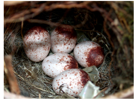
Left: Carolina Wren nest with layers of grasses, moss, and sticks. Center: Top view of Carolina Wren nest. Right: Carolina Wren eggs.