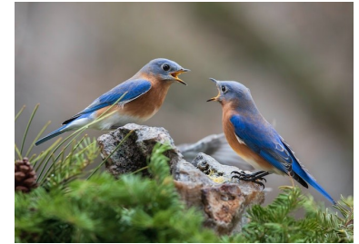
Two male bluebirds sharing the good news!

You can provide sustaining support to VBS by enrolling in membership auto-renewal when you join, renew, or anytime online. Your credit card will be automatically billed when your membership expires and there will be no interruption in your membership or support for VBS. We'll let you know when your auto-renewal is coming up, and you can cancel online at any time.