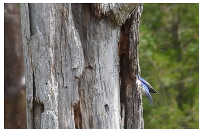
Far left: Bluebird pair, dad with bug.