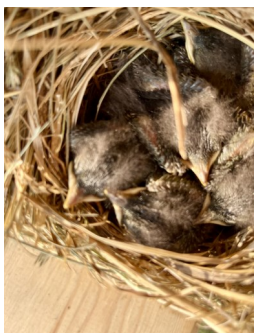
Five bluebird hatchlings.